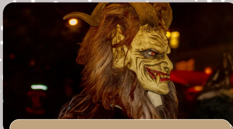
A follower of Krampus dressing up at a festival

Krampus is half demon half goat. In Austria, they hold Krampus festivals on the 5th or 6th December which is known as St. Nicholas Day. They hold a parade where the men in the village dress up with wooden masks and then they run around like idiots trying to scare the hell out of kids. How nice... I don't think so!